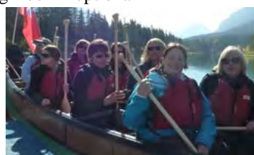
2012 Third Day Optional Canoe Tour