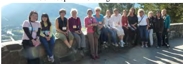
2012 Accompanying Person's tour group at Mount Norquay